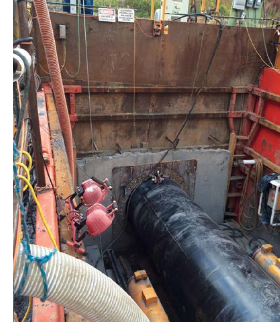
59-inch steel casing was used in lieu of 60-inch to increase overcut in self-supporting ground

والمتشاطين والمحمد أربيك أليسال والمتكليل والتكليس ومطالع وتربي والكليس