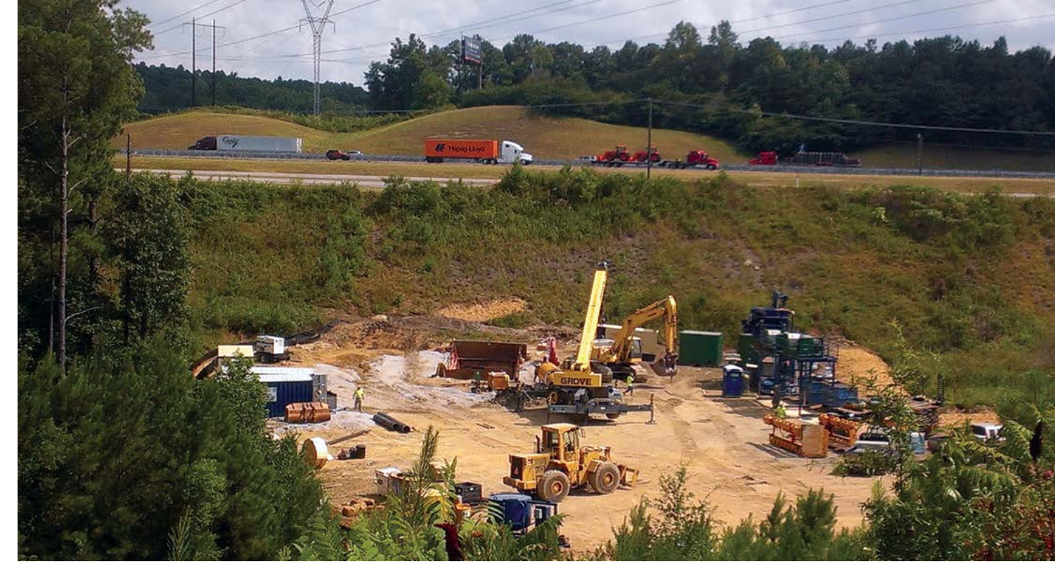
Launch shaft, under 230kv power lines, with view of Highway 78 and Interstate 20 in background.

In a mixed-face and mixed-reach tunnel the MTBM cutterwheel is selected for its ability to deal with the hardest rock in the drive. This can often slow the tunnel excavation through the softer ground, as evident on this project. A hard rock cutter wheel with 14 disk cutters was chosen to handle the hard sandstone. Mining the first 575 feet was extremely laborious and slow, as the soft shale acted like plastic clay. Disk cutters are meant to break rock not scoop sticky clay! In response the microtunneling crew tried various tooling methods on the cutter wheel. There was some success with the different cutting tools, but the time required for face intervention to make tool changes offset any productivity gains. What proved ultimately most helpful in the excavation and separation of the claylike shale was proper use and chemistry of drilling fluids.