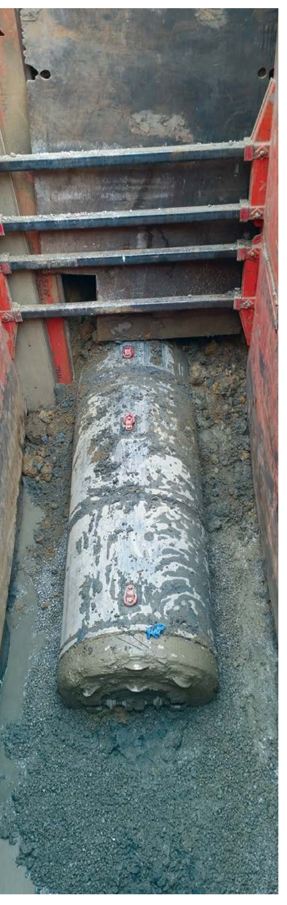
MTBM recovery in receiving shaft